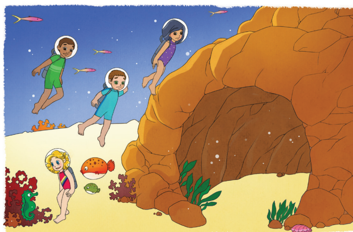
Body out of the group.