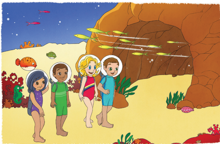
Body in the group.

In our social thinking group we learned about the concept of body in the group . Keeping your body in the group means maintaining a comfortable physical presence around others – not too close, yet not too far away. When your body is in the group, it sends the nonverbal message that you are interested in others and that you are following the same plan. The opposite is also true. If your body is out of the group (too far away), it sends the message you are not thinking about the group. While we often realize the importance of language and what to say in a conversation, it is important to understand that physical proximity is also a key ingredient to successful social interactions.